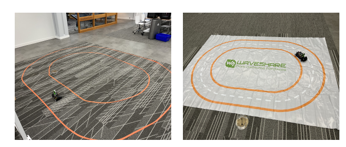
(a) Default track

Once the data is obtained by any of the methods described above,